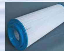
Open Saucer Top