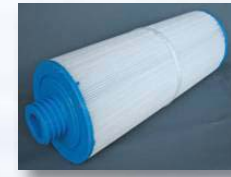
Course Thread Bottom