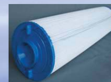
Closed Saucer Top

At Easy Spa Parts, we only provide the original factory-designed filters. You bought the best hot tub, continue using the best filter.