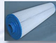
Fine Thread Bottom